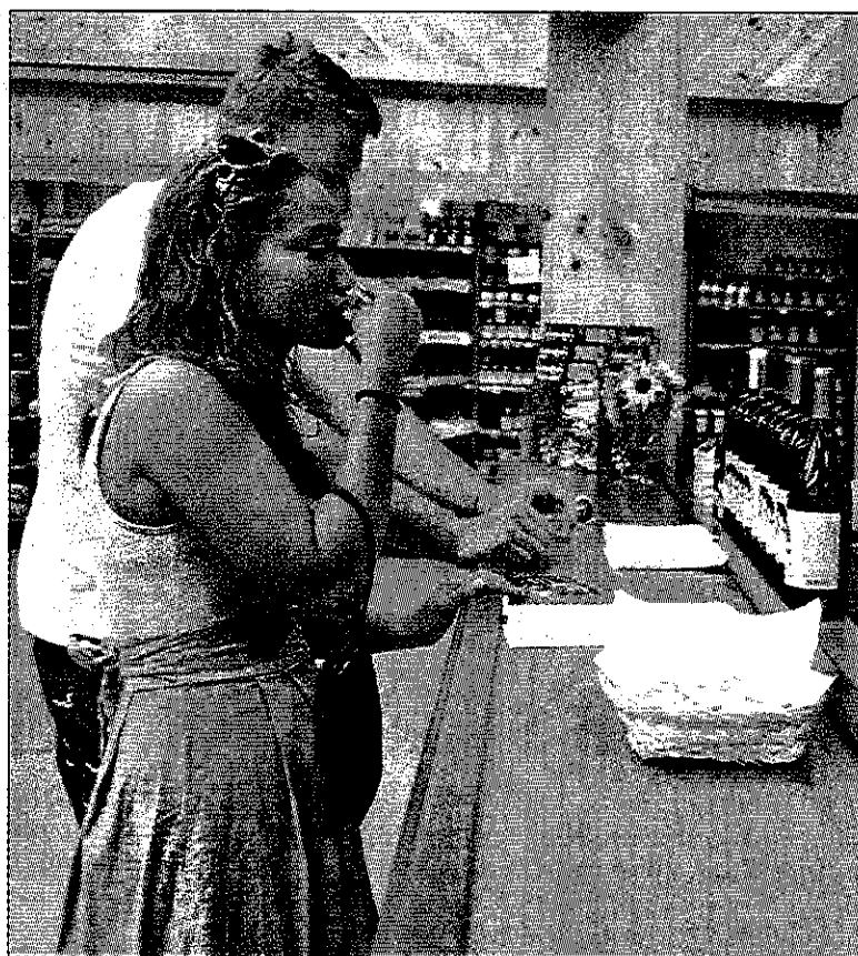
Visitors try out a cross section of wines from Bishop's Orchard's Winery and are invited to take notes on their impressions of each sample.

wines lining shelves and counters, glistening wine glasses at the ready and wine tasting forms at hand.